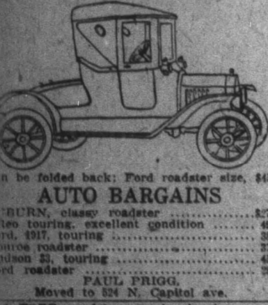
Can be folded back. Ford roadster, size $45.