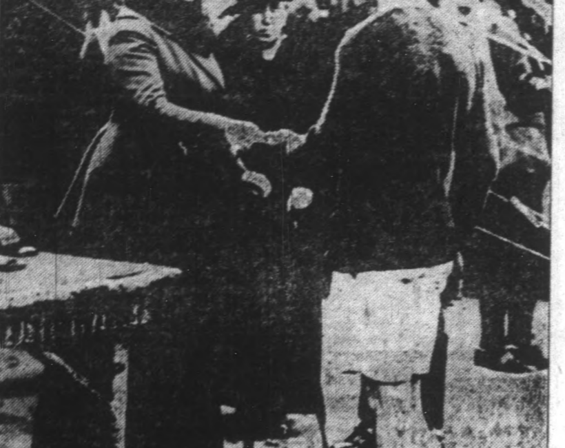
This picture shows the queen of England presenting prizes to American and British soldier athletes at the big meet held recently at Windsor.

Wide finale to postpone Southern boxing show. BOULTS TO BE GIVEN WHEN BAN IS LIFTED—FANS SHOULD HOLD THEIR TICKETS.