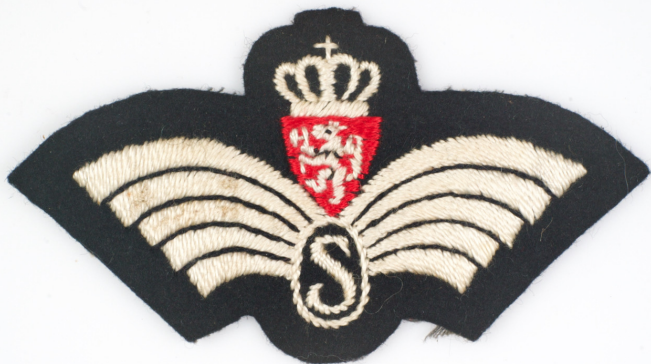
Silk RCAF 1937 pattern Observer Canadian manufacture