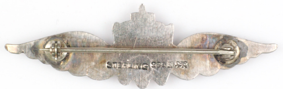
Roden Bros "R", 925, Toronto