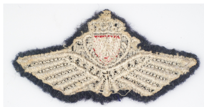
RAF blue wool base, no cover