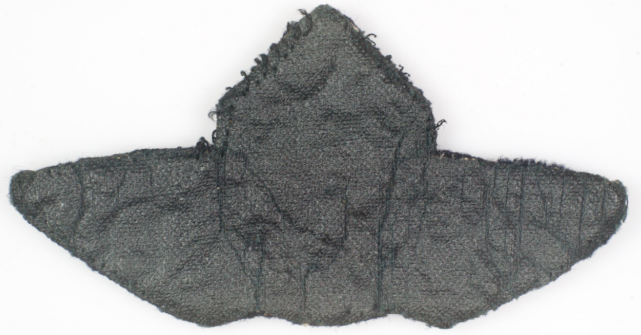
Black wool base - black fabric backing