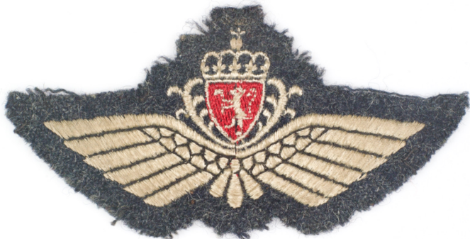
Silk RCAF Pilot, Post-WWII pattern Unknown maker