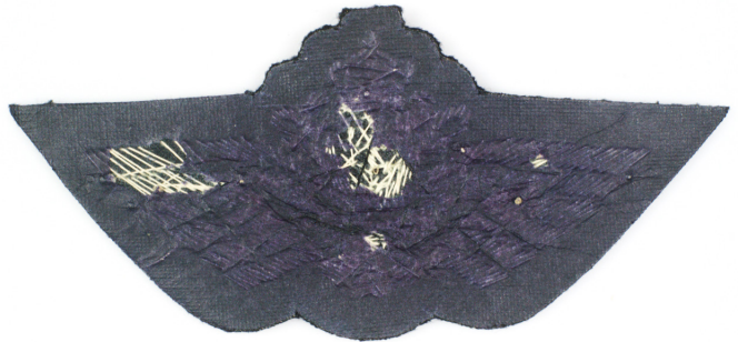
Black wool base - dark navy paper backing