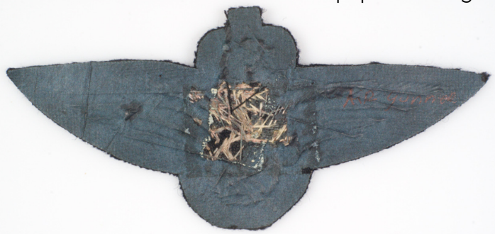
Black wool base - dark blue paper backing