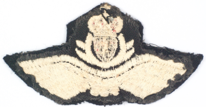
Black wool base - no cover