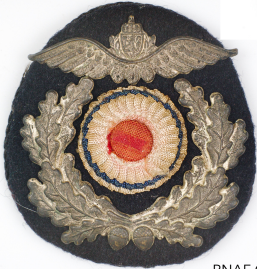
RNAF Officer visor cap cockade Post-WWII 1950s