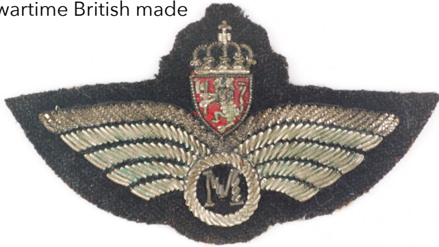
Bullion RCAF flight engineer Post-WWII British made