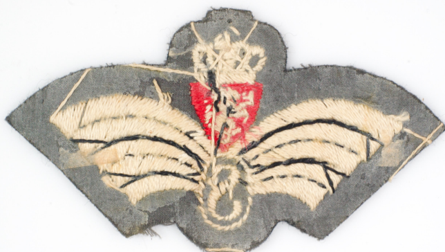
Black wool base - fabric backing