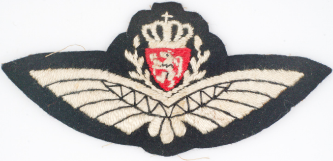
Silk RCAF Pilot Post-1940 pattern Unknown wartime maker