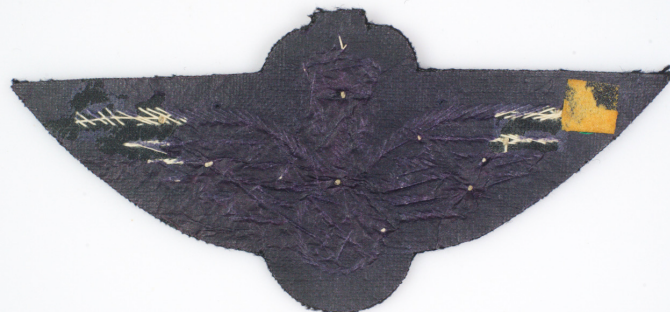
Black wool base - dark blue paper backing