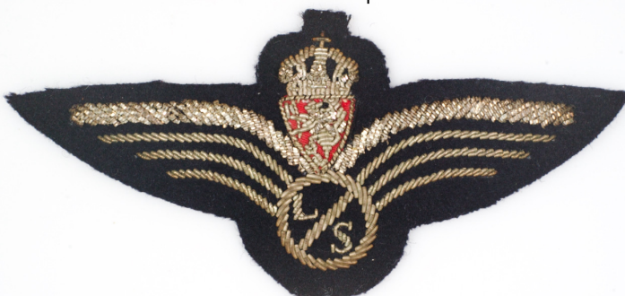
Bullion RCAF Air Gunner post-WWII British made