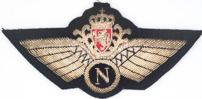
Bullion RCAF Navigator, post-WWII British made