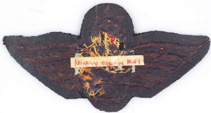
Black wool base - blue paper backing