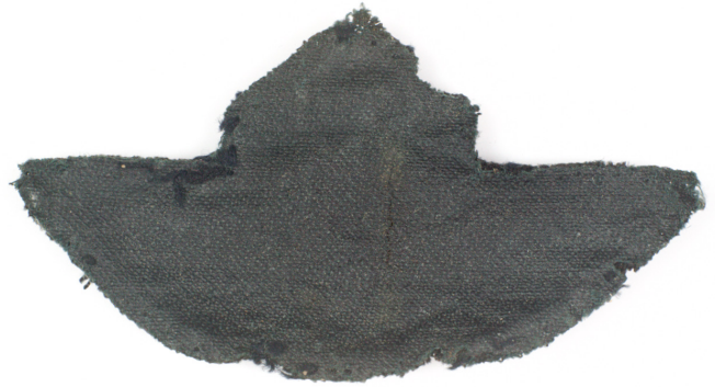
Black wool base - black fabric backing