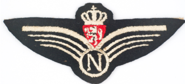
Silk RCAF Navigator wing Canadian manufacture