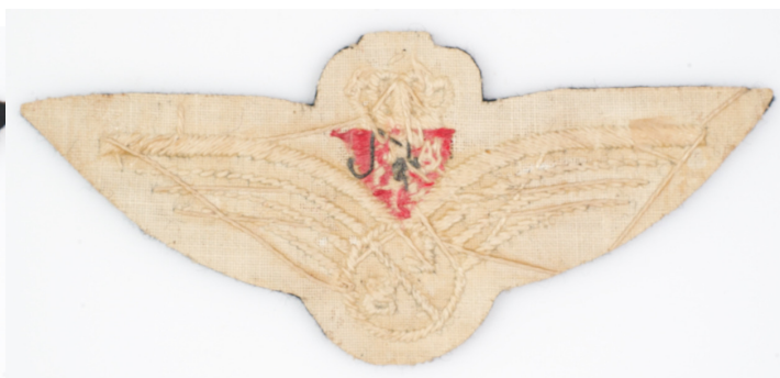
Black wool base - muslin backing