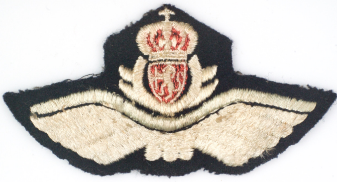
Silk RCAF Pilot Post 1940 pattern Wartime Canadian made