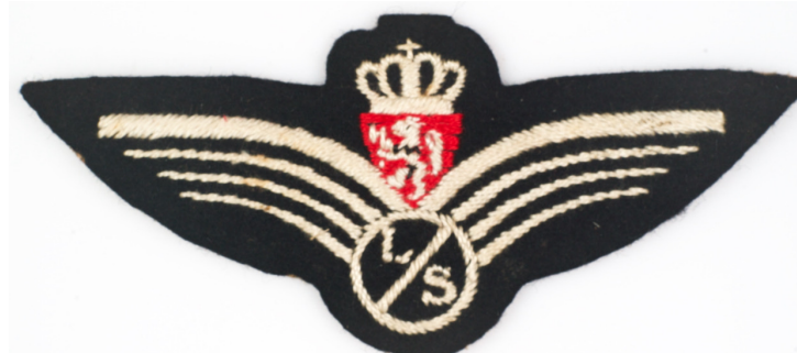
Silk RCAF Air Gunner wing Canadian manufacture