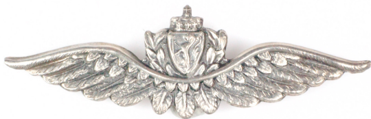
Sterling silver RCAF sidecap badge converted to sweetheart wing