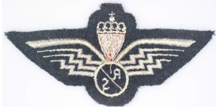
Grey blue wool base - no backing