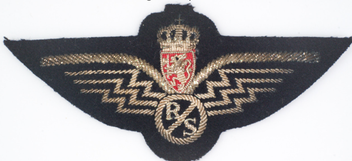
Bullion RCAF Radio/Gunner post-WWII British made