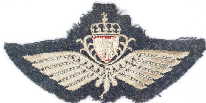
RAF blue wool base, no cover