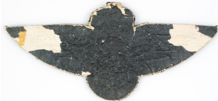
Black wool base - dark blue paper backing