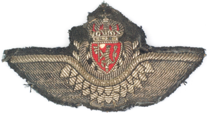
Bullion RCAF Pilot Post 1940 pattern Wartime Canadian made