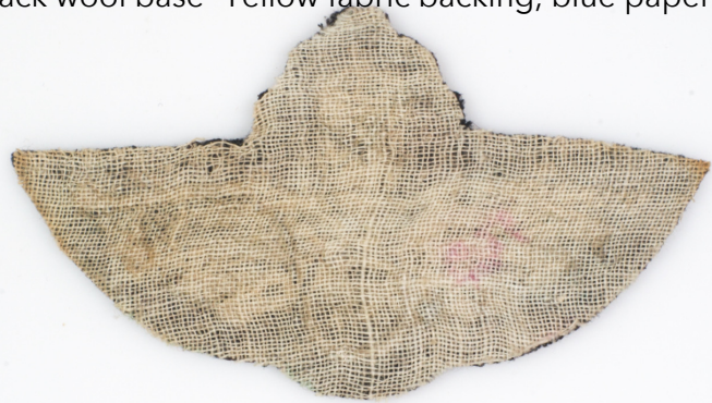
Black wool base - cheesecloth backing