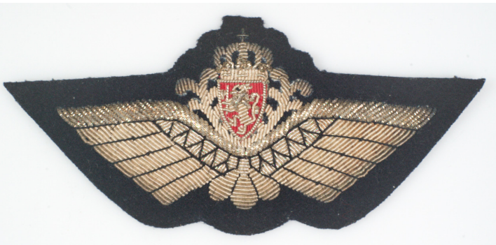
Bullion RCAF Model 1944 Pilot Post-WWII British made