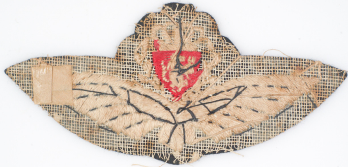
Cheesecloth backing, no cover