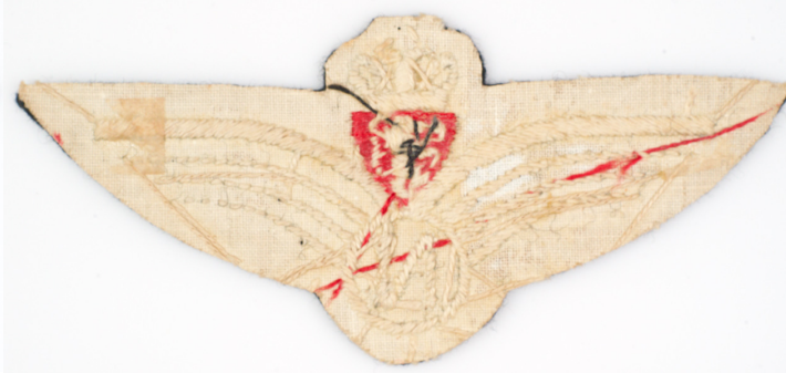
Black wool base - muslin backing