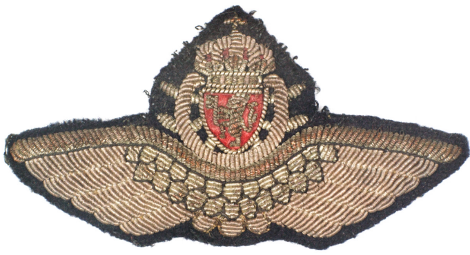
Bullion RCAF Pilot Post 1940 pattern Wartime Canadian made