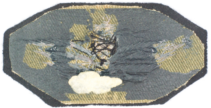
Black wool base -Yellow fabric backing, blue paper