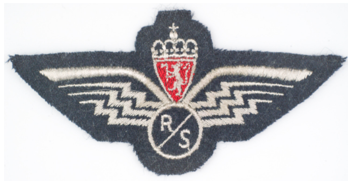
Silk RCAF Radio/Air Gunner !950s manufacture