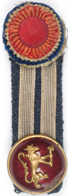
RNAF Officer's sidecap cockade wartime Canadian made