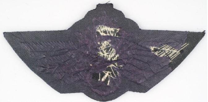
Black wool base - dark blue paper backing