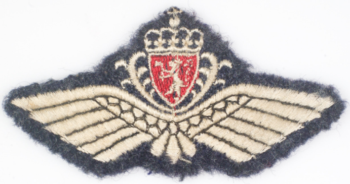
Silk RCAF Pilot, Post-WWII pattern Unknown maker