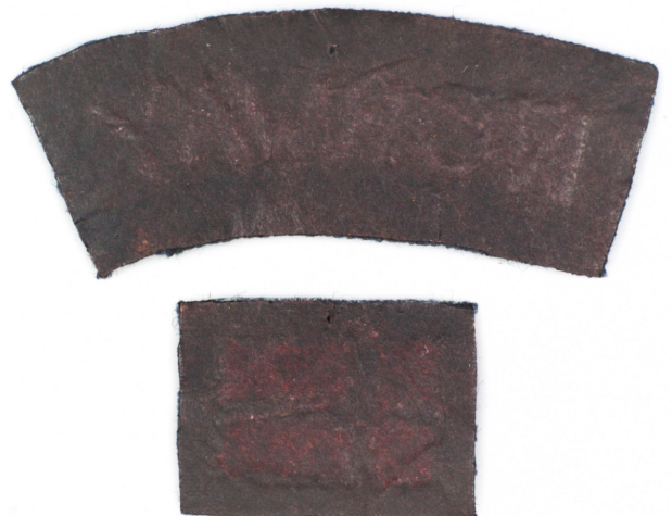
RNAF Nationality titles, post war make or later reproduction?